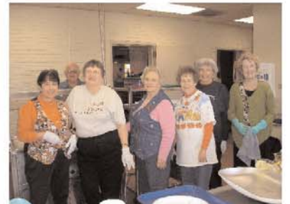
Fall Festival 2007 Treasures Gallery