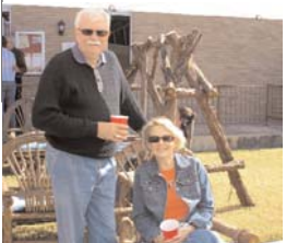
A beautiful day on the commons