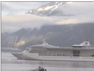
Cubba and Denyce took this of another ship as they were docking in Skagway, Alaska during a cruise.