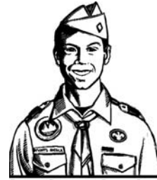
Boy Scout Sunday

This Sunday, February 11, is Boy Scout Recognition Sunday. If you are currently a boy scout and wish to participate in the service, please wear your uniforms and meet in the Narthex at 10:30 for rehearsal. All other Boy Scouts, no matter the age, will be recognized.