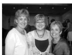
We are blessed with youth, with directors, and with a staff full of fun and excitement.