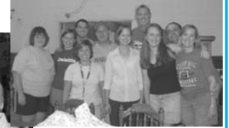
We were blessed with those in charge and children.