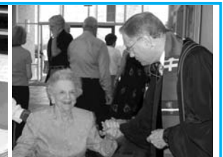
We were blessed with those who retired and those who were hired.