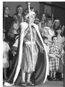
We were blessed with singers and performers.