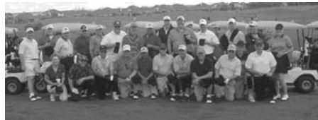
We were blessed with workers and players.