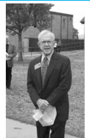
We were blessed with a vision.